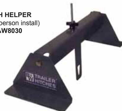
HITCH HELPER (for one person install) B&W8030